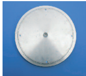
Stainless steel sump covers.