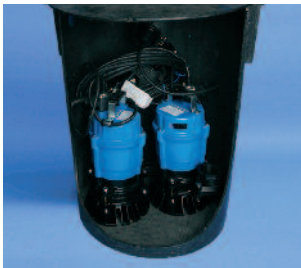
Upgrade a single pump to a dual system in case of pump failure.