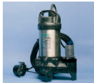
Higher capacity sump pumps.