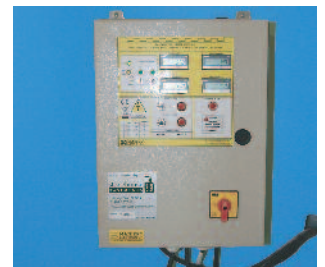
Control panels (with the facility to alert you by telephone should a problem occur)