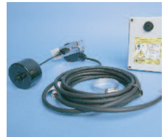
Mains alarm rather than battery operated alarm.