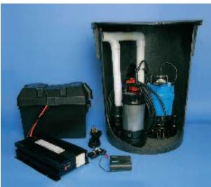
Battery back-up system with converter to run the pumps in the event of a power failure.