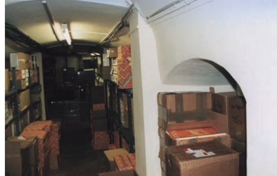
National Association of Estate Agents Headquarters, Warwick. Basement storage after waterproofing.

Professional Waterproofing of basements and cellars creates additional living and working space within a building. Most areas can be made habitable, the damp area removed and the new viable space will add value to the property. The systems recommended will vary according to the type of property, its age and form of construction. Various underground conditions will also affect the approach to treatment including free water and drainage, accessibility and any vibration from traffic.